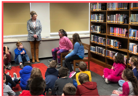
School Bus Safety