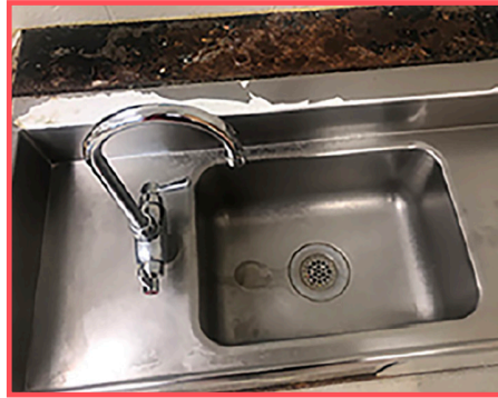
Examples of the sinks to be replaced in the elementary school

contract to Akros MGMT, Inc. of Albany, New York to complete the project. At the time of publication, the District and our architectural firm, CSArch, are working with a representative from Akros to develop the timeline for completion of this project.