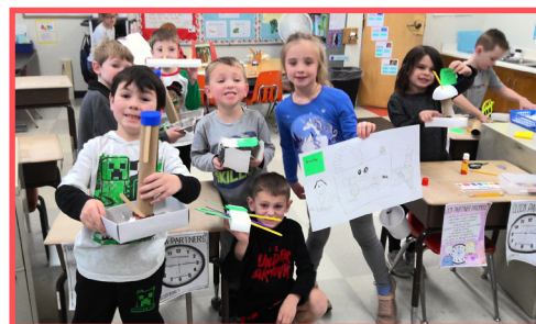
Eager Engineers Club is new this school year. Students in kindergarten and first grade are welcome to join. They meet twice per month after school.