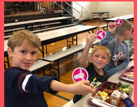
Our students enthusiastically show the stickers they received for trying a product from the Argyle Cheese Farmer.