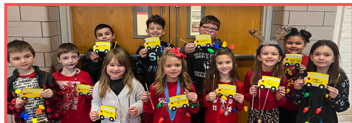
At our monthly Citizens' Assembly students are recognized for being safe and courteous bus riders, Bucket Fillers, Soaring Tanagers, and more.

Thank you to the members of the Hartford Volunteer Fire Company who visited us in October to discuss fire safety. Students were excited to see the fire truck and learn about the equipment. The firefighters reminded students about the importance of fire safety and what to do in an emergency. I hope every family takes the time to create a home fire escape plan, check their smoke detectors and change batteries, and remind children about important fire safety rules. We greatly appreciate the Hartford firefighters for their dedication to our community and the time they volunteer, especially by teaching our youngsters about fire prevention.