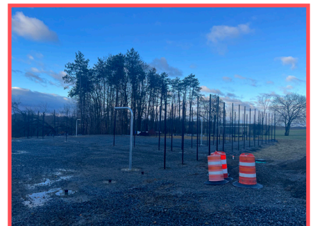
The excavation of the space for various physical education activities