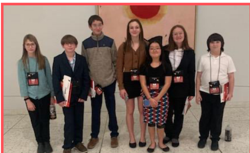
Members of our History Club traveled to the New York State Capitol. They presented two mock bills they wrote for the YMCA Government and Alliance competition. Both bills passed. Great job!