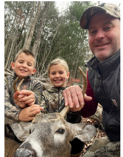
Hunting is one of the many hobbies shared by the family