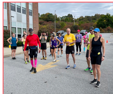
Runners gather for the start of the Spud Run