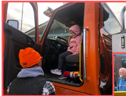
Snow and Winter Safety