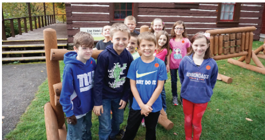
Students grades 3-5 took a field trip to the Adirondack Experience Museum in Blue Mountain Lake.