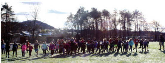
Students braved the chilly temperature to participate in the annual Turkey Trot. Each student earned a food item just in time for Thanksgiving.