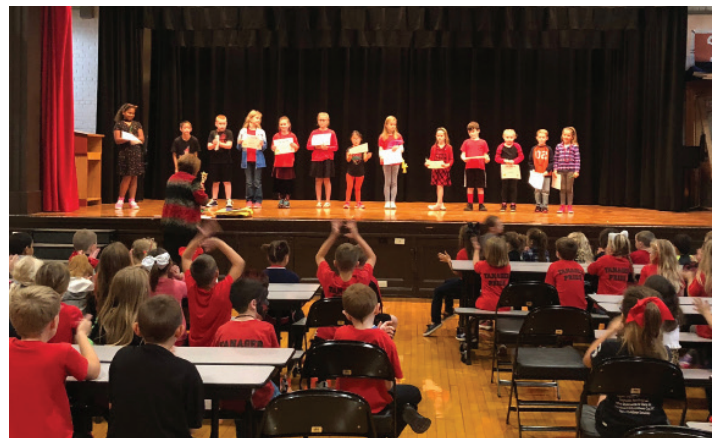
Elementary students are recognized each month for various accomplishments at the Citizens' Meeting.