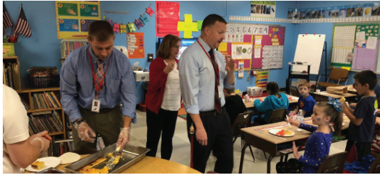
September 26 was NYS School Lunch Day. All elementary students were served a free breakfast in their classrooms by school administrators.

Here are a few snapshots of what our elementary students have been doing. You can view more photos by following us on Facebook or visiting the "Photo Gallery" located on the school's website www.hartfordcsd.org .