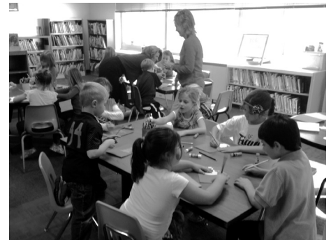
Students create Christmas cards

The remaining Tanager Pride Parties are scheduled for January and April. Students who attain the PBIS goals will be recognized at the end of school year assembly.