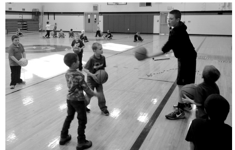
Indoor fun in the gymnasium