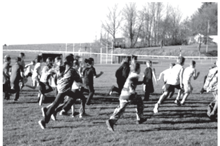
Students of all ages participated in the annual Turkey Trot

REMINDER! Families can sign up for FREE & REDUCED LUNCH anytime during the year. See form inside.